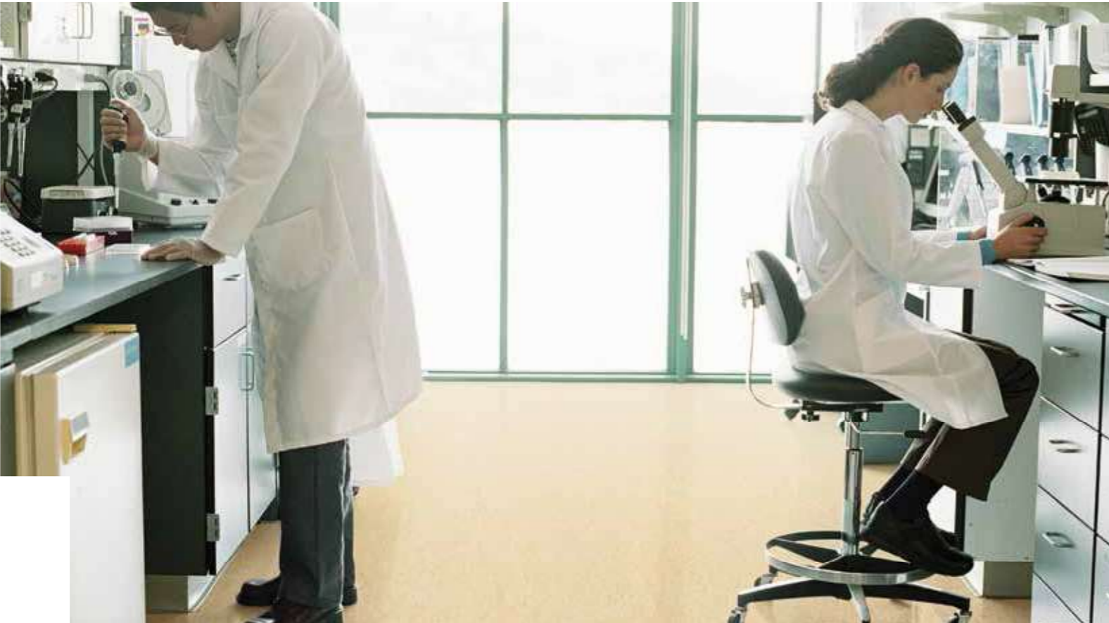
iQ Granit SD - 3096716